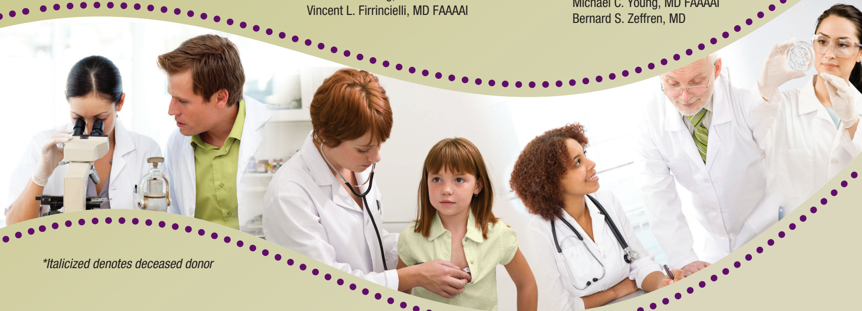
*Italicized denotes deceased donor

A total of 173 donors made their first donation to the ARTrust in 2010.