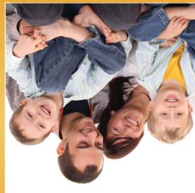
Gifts in Honor