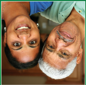
Gifts in Memory

You can help us find treatments and cures.